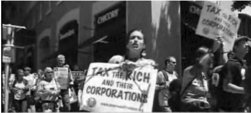
UC students & Berkeley activists join hundreds of protesters in Sacramento. Sixty arrested, including top officials of the Peace & Freedom Party. More to follow?